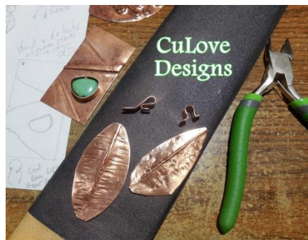
Fold forming copper.