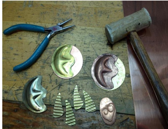
Bench work/metalsmithing pieces.