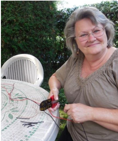
Stripping recycled copper wire.