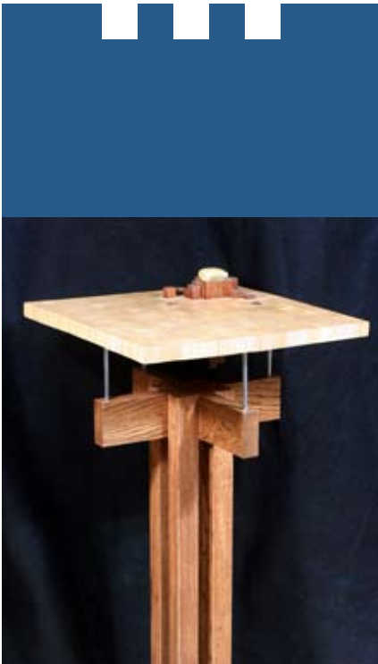
Conrad Kaufman Tables & Paintings Arts Council April