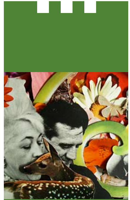
Group Collage Show Arts Council June

For more information, please contact the Arts Council at (269) 342-5059.